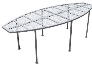
Laser Cut Aluminum