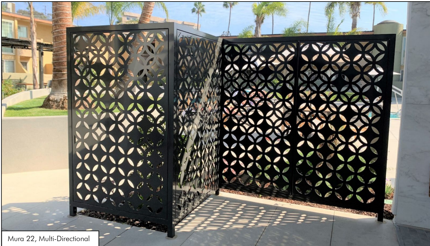
Mura 22, Multi-Directional