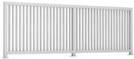
Single or Multi-Section